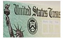
Homeowners Are In For A Big Surprise... Smart Life Weekly