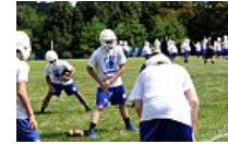
High school football practice