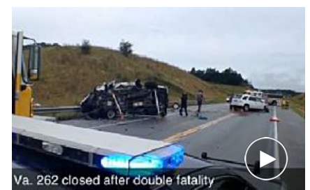
Two killed in wreck on Staunton loop