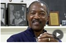
Threads of History : Integrated School Bus Aug 22, 2013