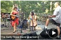
Oak Grove Folk Music Festival Aug 9, 2013