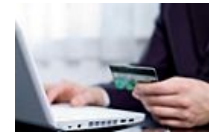
4 Places You Should Avoid Using Your Cr... Bankrate