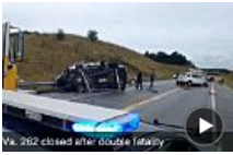
Two killed in wreck on Staunton loop Aug 19, 2013