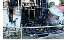
Lake Avenue house fire