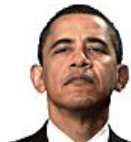
Controversial Video Spreads Virally After ... Moneynews